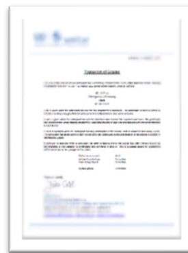
Transcript of Grades