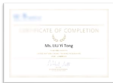
Certificate of Completion