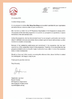
Internship Reference Letter